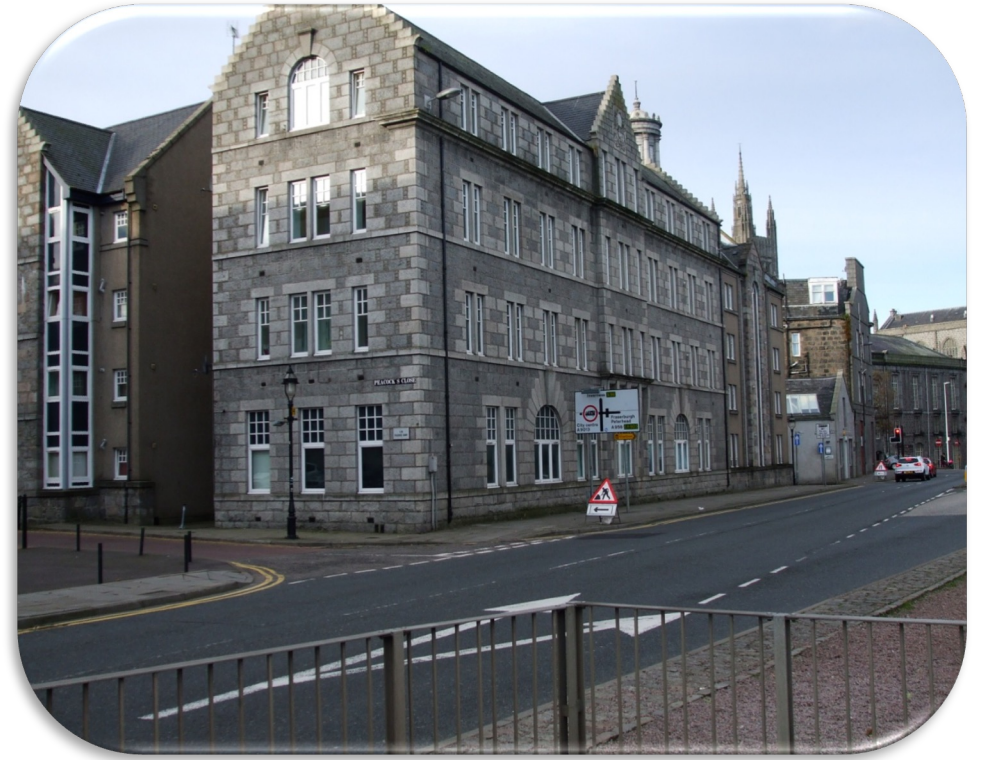
The Old Model Lodging House in 2023