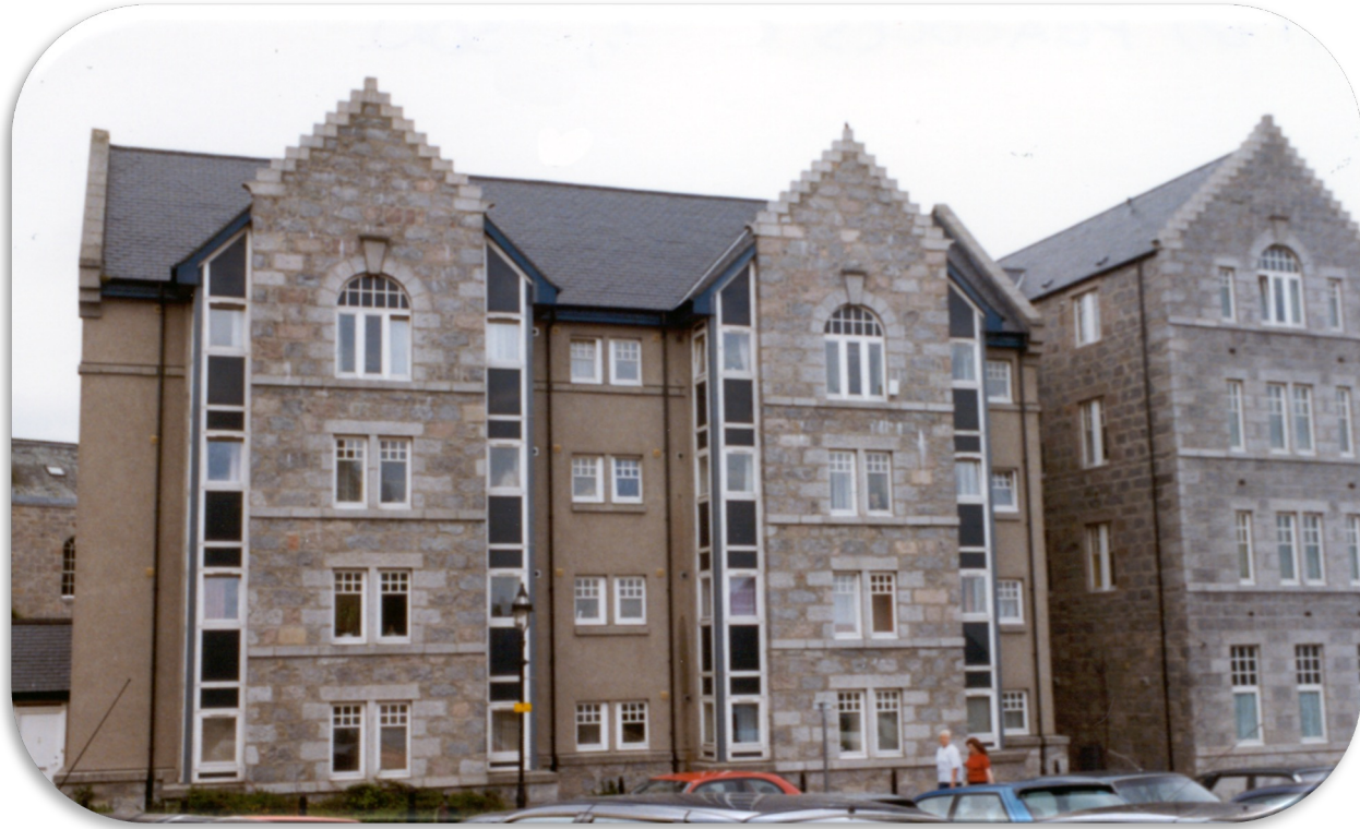
The Old Model Lodging House in 2002